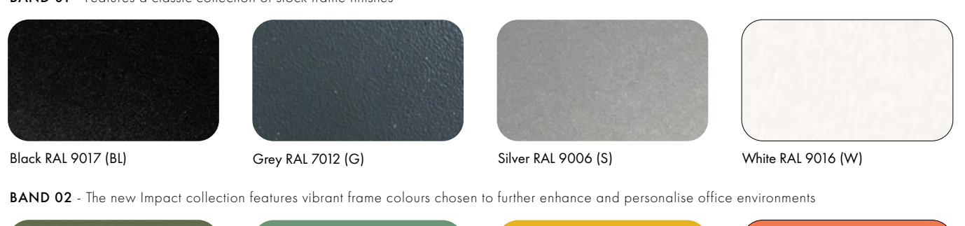
BAND 01 - Features a classic collection of stock frame finishes